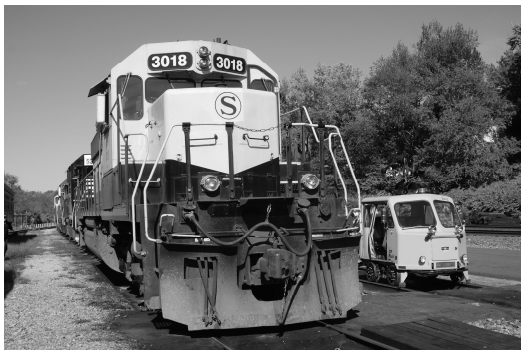
Left: Motorcars and NYS&W 3018 In Little Ferry Yard October 19, 2008

And so ended our 2008 motorcar operating season. All in all it was a great weekend and we are looking forward to running these and other railroads in 2009.