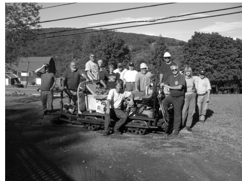
August 2008: CMRR and VRA members after a long day mowing and clearing nearly 11 miles of track.