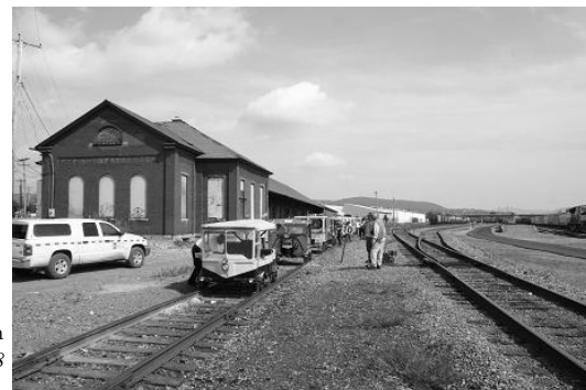
Right: A brief stop at QD in Binghamton September 21, 2008