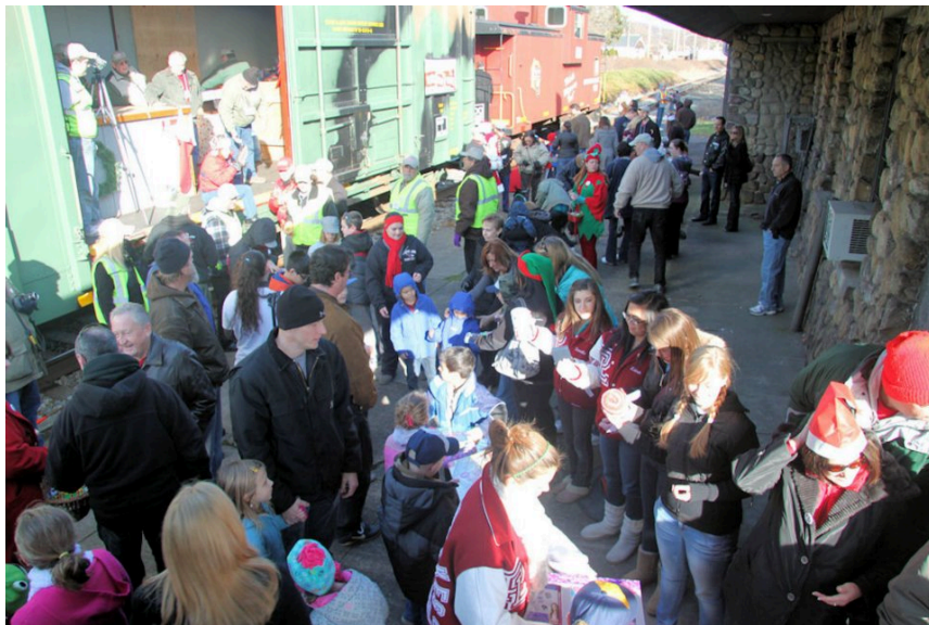
Local citizens in Pompton Lakes help move the donations to the boxcar with remarkable efficiency. "No one gave a second thought about pitching in - absolutely wonderful!"

I am very happy to report that 2011 was the third very successful year for Operation Toy Train. The Military Transport Association of New Jersey along with the VRA, Norfolk Southern, NYS&W, and M&E ran two days of trains on December 10 th & 11 th , 2011. On Saturday December 10 th , the train ran from Ridgefield Park to Butler with stops at Maywood, Hawthorne, Wortendyke, Wyckoff and Pompton Lakes. The weather cooperated and the overall turnout for the day was quite good and over 5000 toys were collected by the end of the day. UPS and Ikea both made huge contributions with a $3200 donation and over 250 toys respectively. The Hot Dog Caboose in Wortendyke was open and offered food to our Marines and volunteers at no charge. The Wyckoff Fire Department brought out a number of