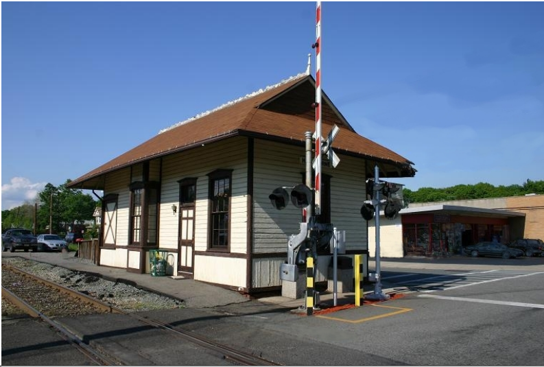
The station as it stood for all its life before 2010.

Hawthorne Station circa 1915. Note the lack of automated crossing protection!