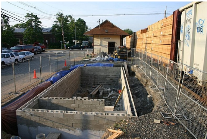
The new foundation gives the station a brand new feature - a basement.