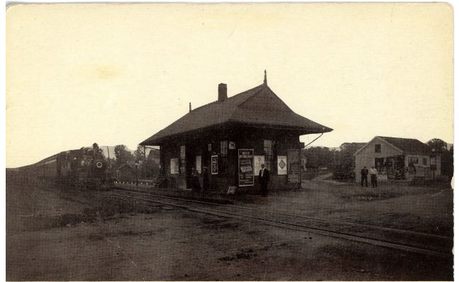
HAWTHORNE'S BUSY CORNER, HAWTHORNE, N. J.

In honor of the grand re-opening of Hawthorne Station this month, we present to you a selection of photographs chronicling the station.