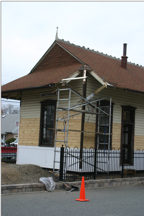
Now safe from the threat of countless trucks, the northeast corner of the station's roof undergoes repair for, hopefully, the last time.

Please invite your friends and relatives to come down and take part in this historic day and to show off the work a small but dedicated group of people can do when they put their minds to it. ☒