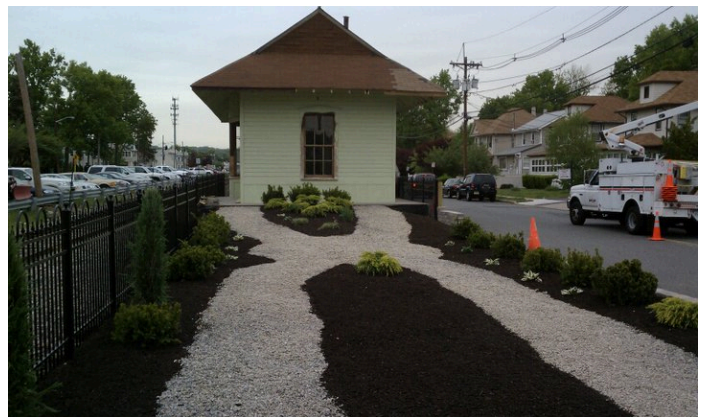
May, 2011 - after years of dedication (and some blood, sweat and tears), it's all about to conclude.