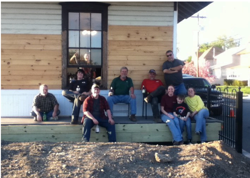
Part of the Hawthorne Station restoration crew takes a break

For 117 years, Hawthorne station has stood at the corner of Royal and Diamond Bridge Avenues. Although it now stands seventy-five feet north (railroad west) of where it spent 116 of those years, it is now safe from turning trucks and certain destruction.