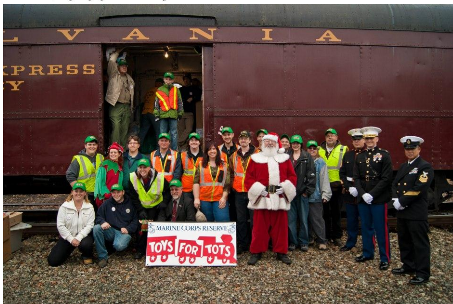
Members, Family and Friends of the VRA, NYSW, Middletown & New Jersey, Morristown & Erie and Military Transport Association pose with the train's honored guests of the United States Marine Corps. and United States Navy and Santa!